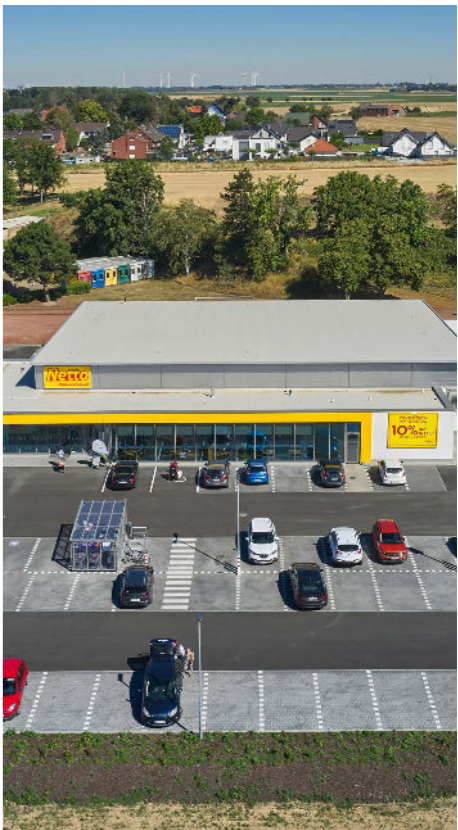
Developing the marketplaces of tomorrow. Netto market in Titz-Rödingen.