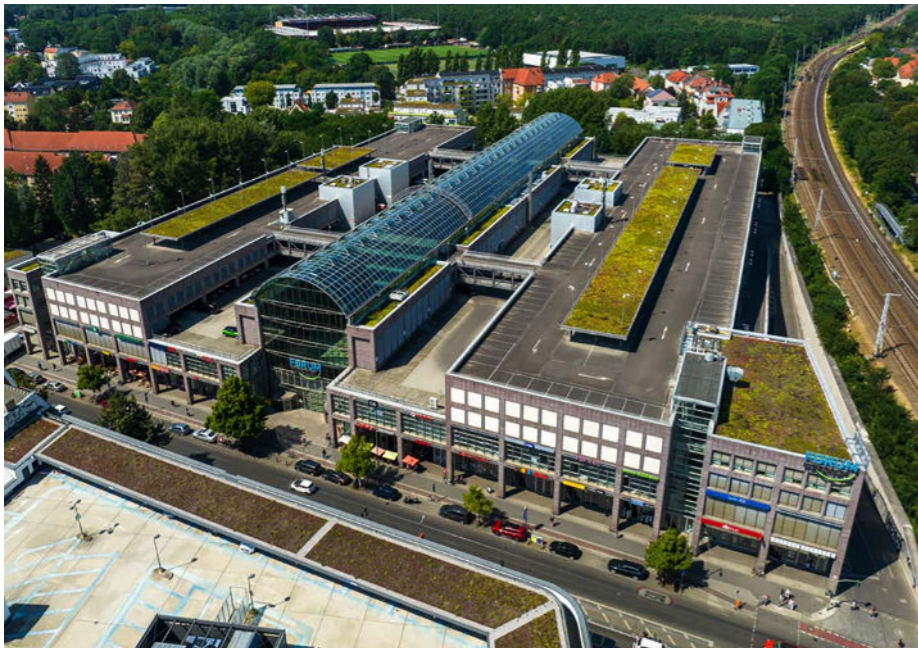
Forum Köpenick: Project development, asset, property and centre management, and transformation.

precisely tailored to the needs of the relevant target groups in the catchment area. JRE thus creates and manages the marketplaces of tomorrow , with local amenities and community services.