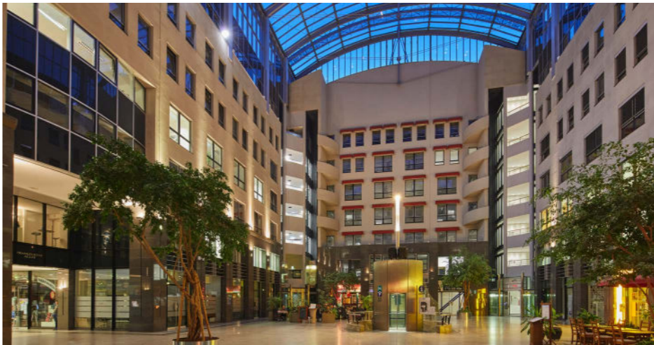
Mixed-use project: Plaza Frankfurter Allee Berlin – office and commercial building with private university: project development, asset, property and building management.